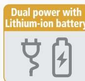
Dual power with Lithium-ion battery